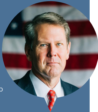
Governor Brian P. Kemp

"It's great to see the amazing work done by hardworking Georgians in Ben Hill County. We are excited to watch MANA Nutrition serve communities in need worldwide with products from our state's No. 1 agriculture industry. We have been laser-focused on creating impactful opportunities across the state, and jobs like these will be good for the local community for years to come."