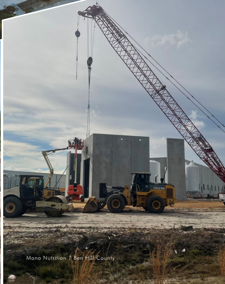
Mana Nutrition | Ben Hill County