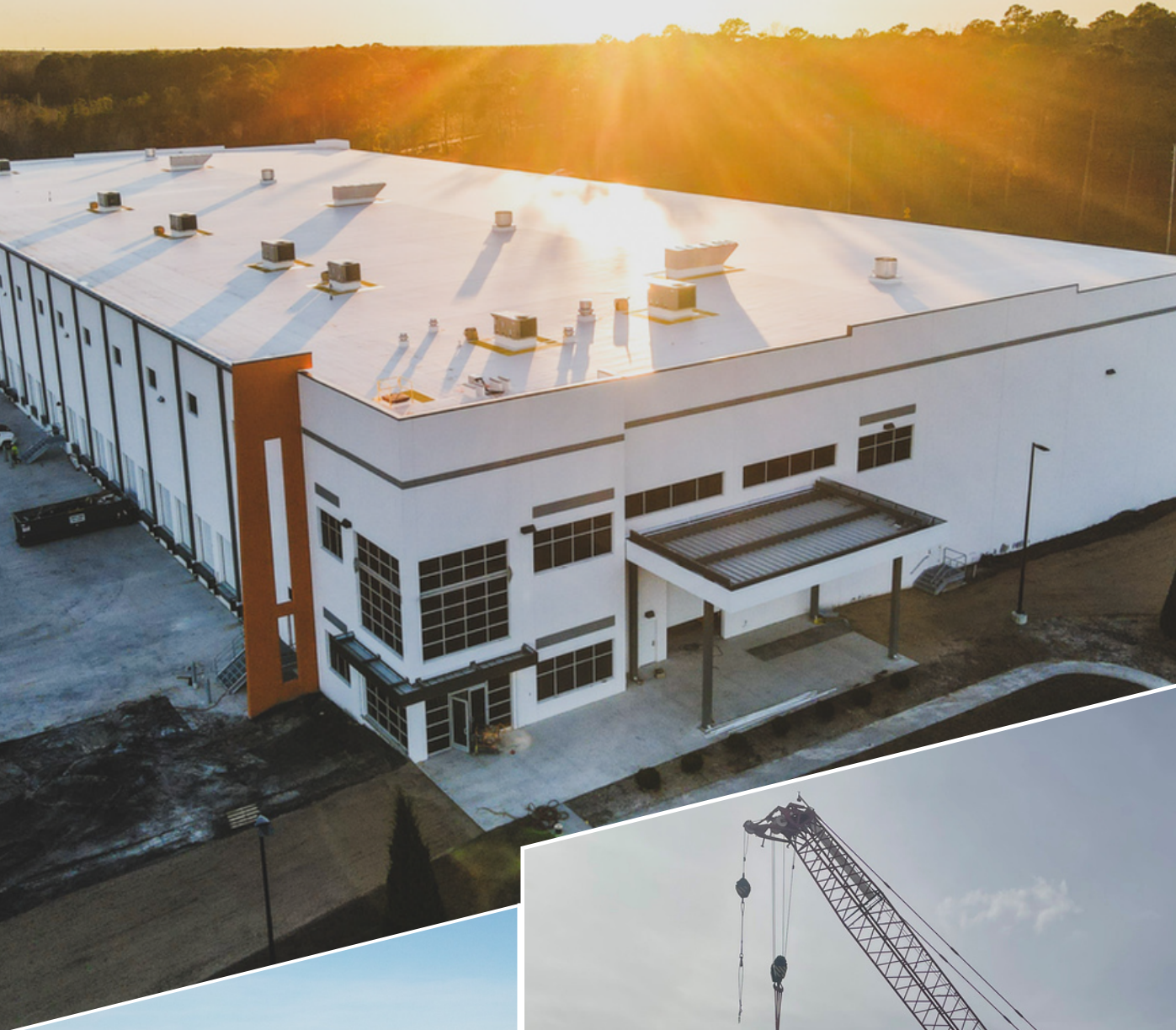
Harris Expansion | Crisp County